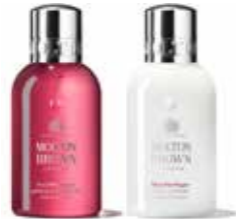
Fiery Pink Pepper Bath & Shower Gel and Body Lotion

LONDON VIA REUNION ISLAND A humid dusk on the descent of Cirque de Salazie. Jewelled birds of paradise flaunt across warm air. The scent of crushed sweet spices drift over colourful rooftops. Entice curiosity with aromatic adventure.