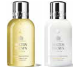
Indian Cress Purifying Shampoo and Conditioner

The plant and mineral extracts in our irresistibly scented Shampoos and Conditioners make hair look shiny and healthy with a beautiful, lingering fragrance.