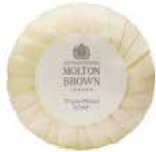
Triple Milled Soap – pleat wrapped

Enrich their cleansing ritual with our creamy triple-milled milk soaps, designed to clean, nourish and protect the skin.