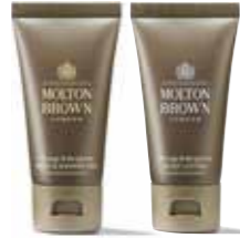
Orange & Bergamot Bath & Shower Gel and Body Lotion

LONDON VIA SEVILLE A courtyard of orange trees in dappled shade. Lively citrus airs dancing the flamenco at dawn. Azure blue skies above. Awaken your spirits with our modern classic, plucked from the naranja grove.