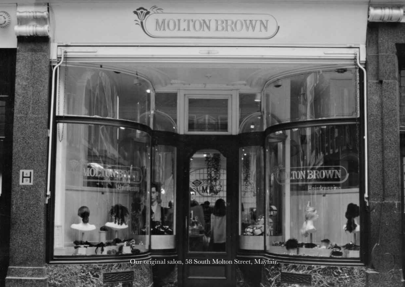
Our original salon, 58 South Molton Street, Mayfair.