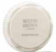
Shoe Polish (Resealable)