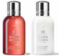
Heavenly Gingerlily Bath & Shower Gel and Body Lotion

LONDON VIA TAHITI Black sands slipping into a Polynesian lagoon. Delicate ginger lilies peek through the foliage. Fragrant spices perfuming the breeze. Entice your wanderlust with an escape to Tahitian shores.