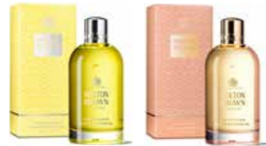
Orange & Bergamot

Made to beautifully nourish and replenish skin, refined fragrances enrich each individual bathing oil for a sumptuous bathing ritual.