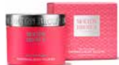
Fiery Pink Pepper