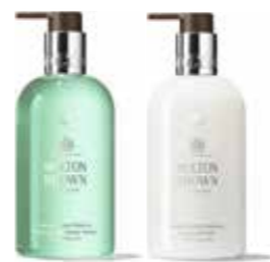
Refined White Mulberry Fine Liquid Hand Wash and Hand Lotion

LONDON VIA LES CEVENNES Winding rivers flowing through verdant valleys. Mulberry trees hooked along the slopes in early morning mist. Freshly tied bouquet garnis, just gathered. Renew your senses with a ramble through the mountains.