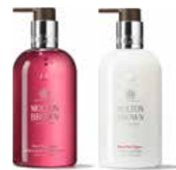
Fiery Pink Pepper Fine Liquid Hand Wash and Hand Lotion

LONDON VIA REUNION ISLAND A humid dusk on the descent of Cirque de Salazie. Jewelled birds of paradise flaunt across warm air. The scent of crushed sweet spices drift over colourful rooftops. Entice curiosity with aromatic adventure.