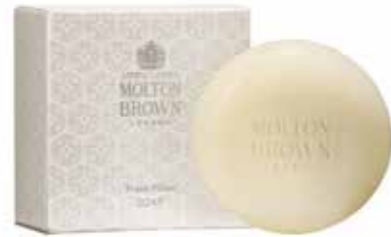
Triple Milled Soap – boxed

Available in 25g (0.88oz) and 45g (1.59oz)