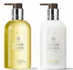
Orange & Bergamot Fine Liquid Hand Wash and Hand Lotion

Indulge your guests in our luxury Hand Care, bursting with rich, aromatic notes whilst nourishing and caring for the skin. House them in our chrome dispenser to add a sleek finishing touch to your bathrooms.