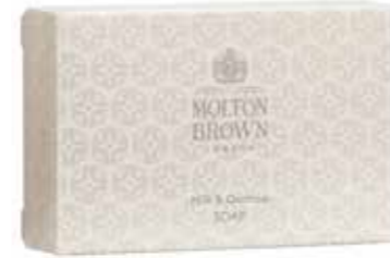
Milk & Oatmeal Soap

Available in 25g (0.88oz) and 45g (1.59oz)