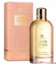
Jasmine & Sun Rose