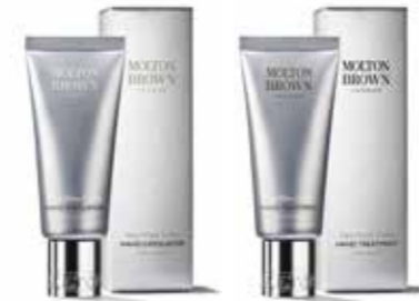
Alba White Truffle Hand Exfoliator & Treatment

An ultra-rich treatment that flawlessly sinks into skin for long-lasting moisturisation. Instantly soothe dry skin and cushion hands with an exceptionally nourished touch.