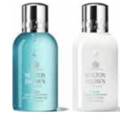
Coastal Cypress & Sea Fennel Bath & Shower Gel and Body Lotion

LONDON VIA CAPE YORK A salt-sprayed collision of the ocean swell against rugged outcrops. Waves lapping in uncharted caverns. A peninsula awaiting great exploration. Awash your senses with sea-soaked adventure.