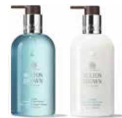
Coastal Cypress & Sea Fennel Fine Liquid Hand Wash and Hand Lotion

LONDON VIA CAPE YORK A salt-sprayed collision of the ocean swell against rugged outcrops. Waves lapping in uncharted caverns. A peninsula awaiting great exploration. Awash your senses with sea-soaked adventure.