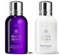
Relaxing Ylang-Ylang Bath & Shower Gel and Body Lotion

LONDON VIA THE COMOROS ISLANDS Creamy-white, soft, secluded sands. The air heady with the scent of sweet evening flowers. A hammock swaying between two palms. Fall into a deep slumber on the Perfume Isles.