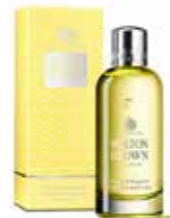
Orange & Bergamot