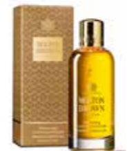
Mesmerising Oudh Accord & Gold