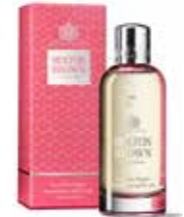
Fiery Pink Pepper