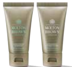
Kumudu Volumising Shampoo and Conditioner

Out with daily grime. In with a shampoo for smooth, shiny hair with aromas of jasmine, honeysuckle and sandalwood.