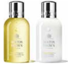
Orange & Bergamot Bath & Shower Gel and Body Lotion

LONDON VIA SEVILLE A courtyard of orange trees in dappled shade. Lively citrus airs dancing the flamenco at dawn. Azure blue skies above. Awaken your spirits with our modern classic, plucked from the naranja grove.