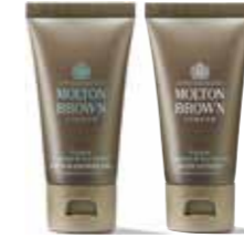
Coastal Cypress & Sea Fennel Bath & Shower Gel and Body Lotion

LONDON VIA CAPE YORK A salt-sprayed collision of the ocean swell against rugged outcrops. Waves lapping in uncharted caverns. A peninsula awaiting great exploration. Awash your senses with sea-soaked adventure.