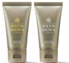
Indian Cress Purifying Shampoo and Conditioner

The plant and mineral extracts in our irresistibly scented shampoos and conditioners make hair look shiny and healthy with a beautiful, lingering fragrance.