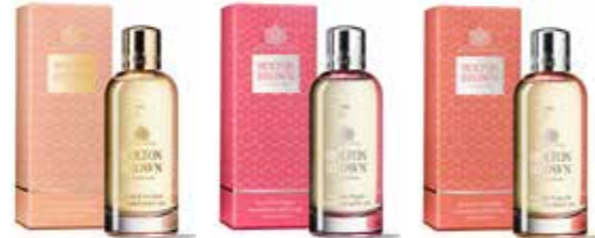
Jasmine & Sun Rose

Our enriching dry oils melt into skin, leaving it feeling soft, smooth and nourished. Imbued with distinctive aromas for a truly indulgent sensorial experience.