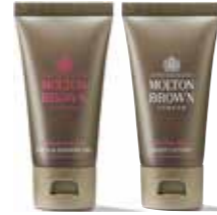
Fiery Pink Pepper Bath & Shower Gel and Body Lotion

Available in 30ml (1 fl oz), 50ml (1.7 fl oz) and 80ml (2.7 fl oz)