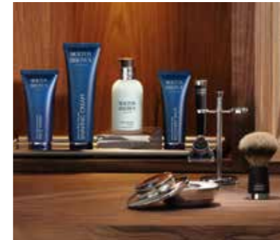
Men's Grooming Menu

An ultra-rich treatment that flawlessly sinks into skin for long-lasting moisturisation. Instantly soothe dry skin and cushion hands with an exceptionally nourished touch.