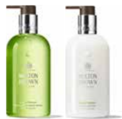
Lime & Patchouli Fine Liquid Hand Wash and Hand Lotion

LONDON VIA THAILAND An alfresco bay market, shaded under a parasol of palm fronds. The piercing zest of verdant green makrut limes. Bountiful clusters of shiny, crushed leaves and glass bottles filled with rich oils. Uplift your essence with the abundant flavours of Ban Krut.