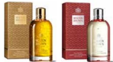
Mesmerising Oudh Accord & Gold