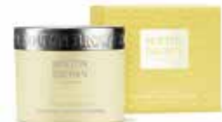
Orange & Bergamot

Each indulgent Body Polisher is enriched with a unique exfoliating ingredient and iconic fragrance. Experience caressingly soft, beautifully scented skin.