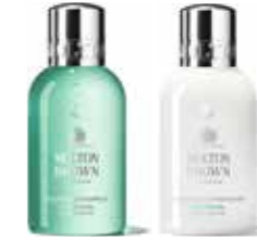
Kumudu Volumising Shampoo and Conditioner

Hair is thoroughly nourished and the scalp is refreshed. With cleansing Indian cress extract and shine-enhancing amino acids, hair is given a lustrous, healthy-looking finish, delicately fragranced with enticing aromas of jasmine, honeysuckle and sandalwood.