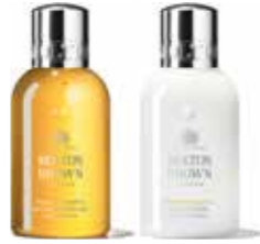
Vetiver & Grapefruit Bath & Shower Gel and Body Lotion